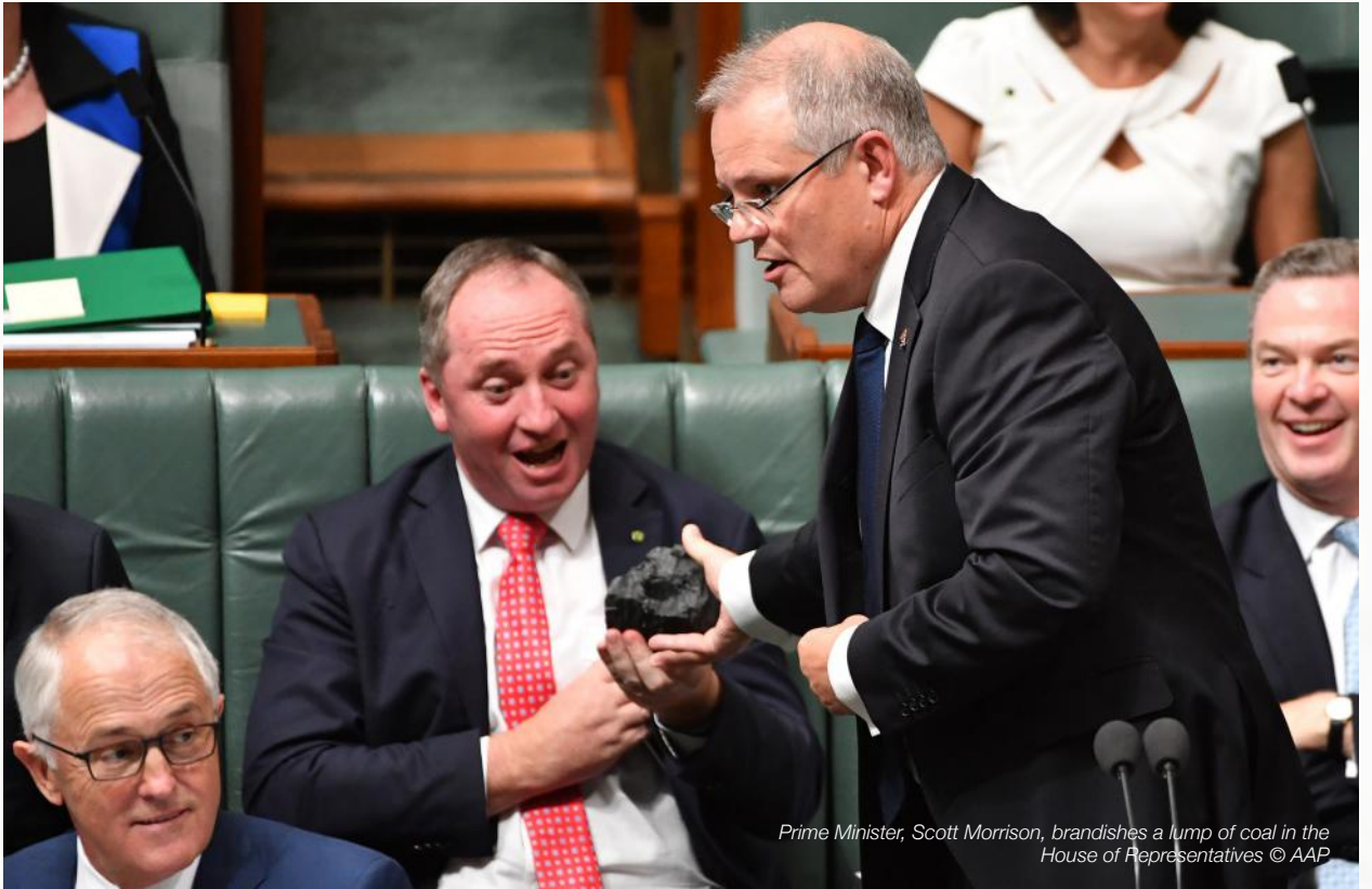
Prime Minister, Scott Morrison, brandishes a lump of coal in the House of Representatives