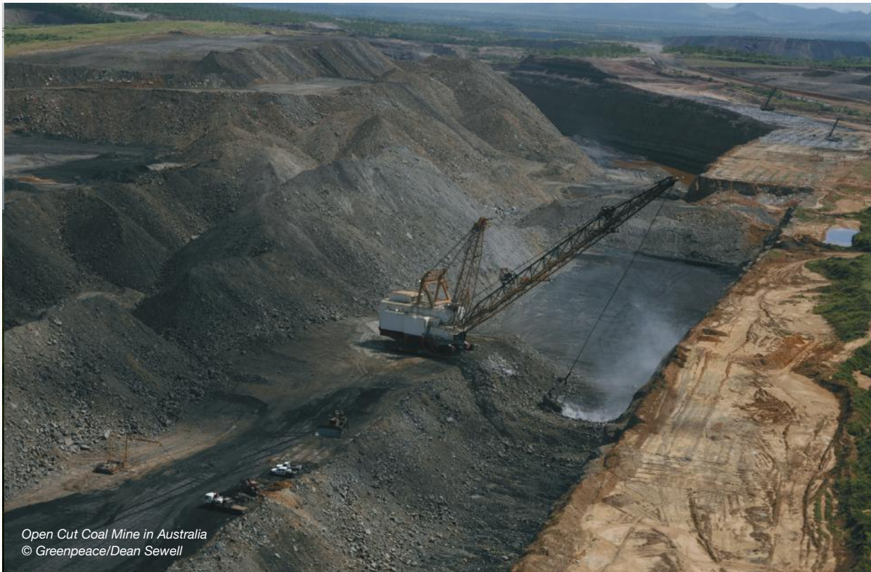
Open Cut Coal Mine in Australia

Santoro and Sciacca were both born in Sicily and are each prominent figures in the Australian-Italian community. Santoro has also held the role of president of the Italian Chamber of Commerce and Industry 105 , hosting many guests from the political, business and Italian community. 106 Santoro's Queensland Liberal faction included George Brandis, former Liberal Party member of the Australian Senate, leader of the government in the Senate during the Turnbull leadership period 2015-2017 and attorney-general of Australia during the Abbott-Turnbull leadership period from 2013-2017. 107