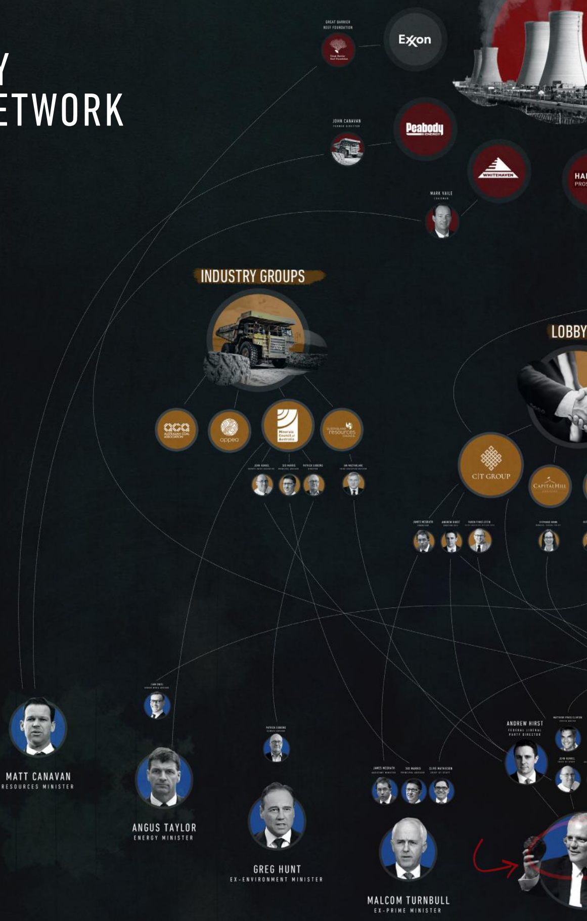
MATT CANAVAN RESOURCES MINISTER