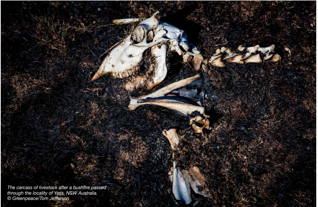
The carcass of livestock after a bushfire passed through the locality of Yass, NSW Australia.