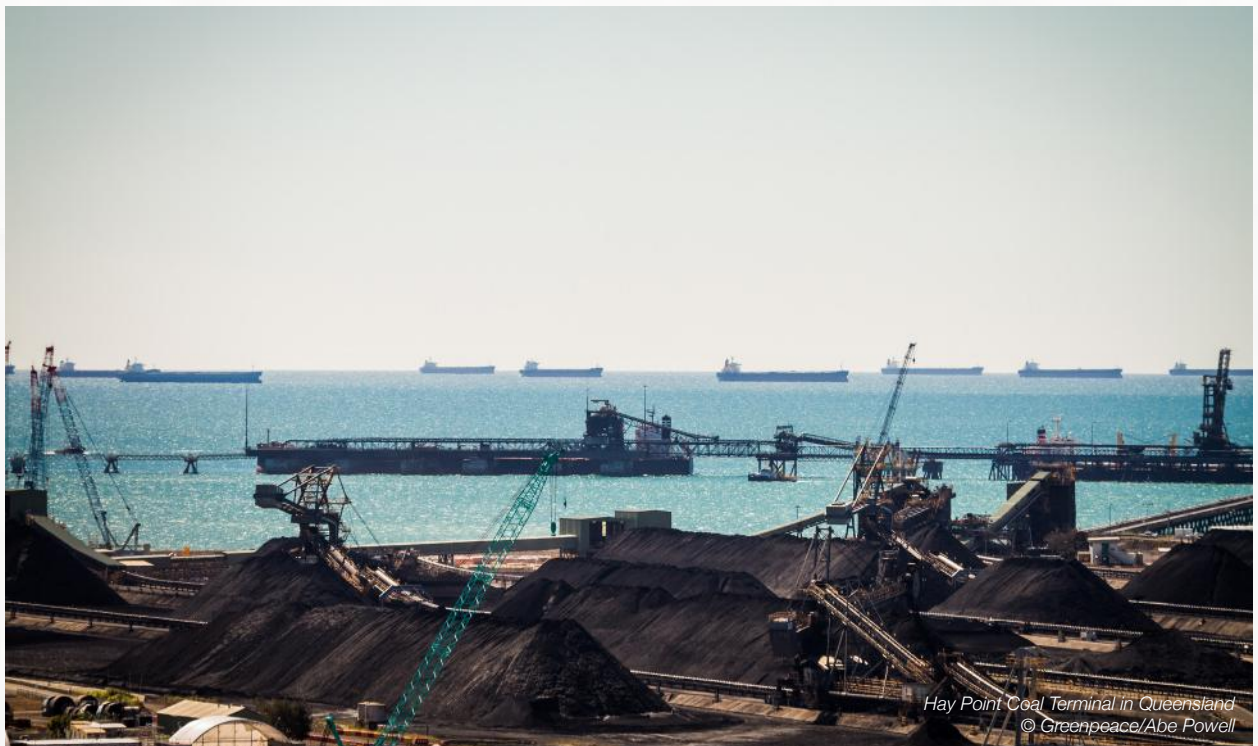
Hay Point Coal Terminal in Queensland

Matt Canavan and James McGrath's role in the Dirty Power network have already been outlined in this report above. Queensland Environment Minister, Leanne Enoch, said that the decision 'reeks of political interference'.